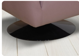
FOOT OPTION 2: STAINLESS STEEL TITANIUM FINISHING BASE