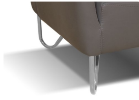
FOOT OPTION 3: STAINLESS STEEL FINISHING