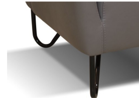
FOOT OPTION 4: STAINLESS STEEL TITANIUM FINISHING

LEATHER COLOR SHADE DIFFERENCES: The model upholstered with some Natural leather such as Maya, Moss, Carees and Sensation, could present in some area differences in color tones of about 5%. Such differences are not to be considered defect but an expression of the natural characteristic of the cowhide. The company reserves the right without prior notice to make technical sheets changes and/or materials for quality product improvement. Leather sofas are a handmade product and according to the leather covering selected there could be a measurement tolerance of about 2 inches (cm 5) on each sku.